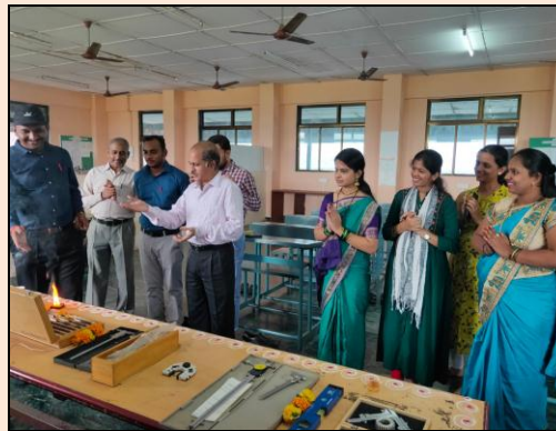
Khande Navami (Dasehra) Celebration at Mechanical Engineering Department