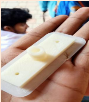
3D Printed component